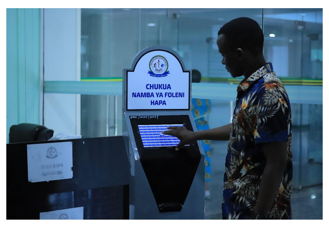
Figure 1 ticket placer