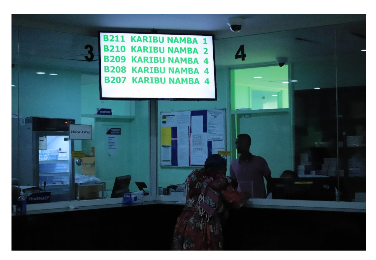
Figure 3 a request is automatically queued in ascending order (first come first out)waiting for the service provider to call the client, the call will then be displayed on digital signage